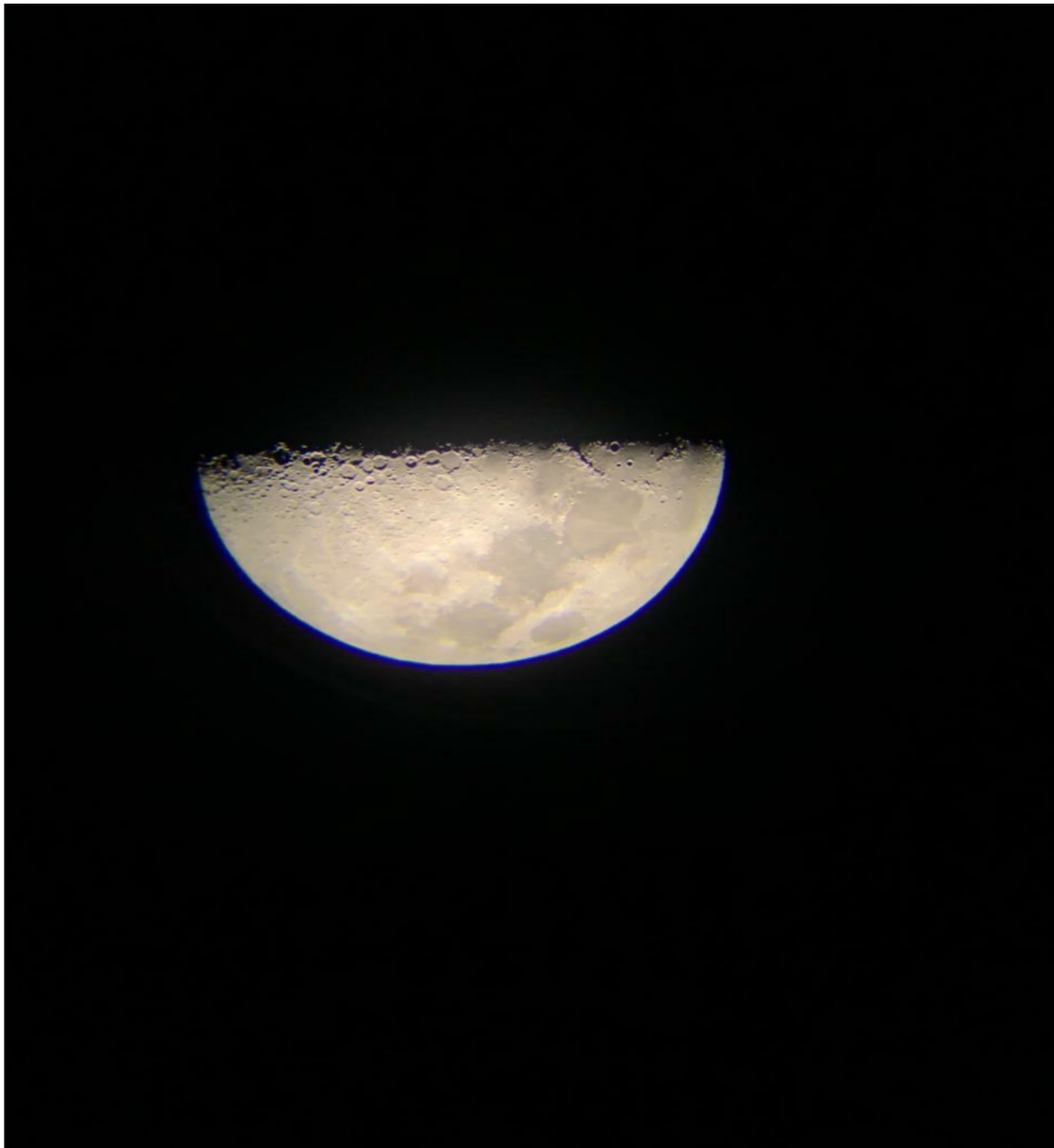
Fig. 4: Picture of the Moon captured

As the sun sets slowly and we have seen the moon. We take our telescope to a place from which the moon could be seen. Fixing all the nobs and focusing the lens a beautiful, clear moon was seen by us. The craters on moon were clearly visible there. A Barlow lens was used to see the moon more clearly. Barlow lens create magnified image by increasing the effective focal length of the telescope. The Orion were also seen in the sky that day.