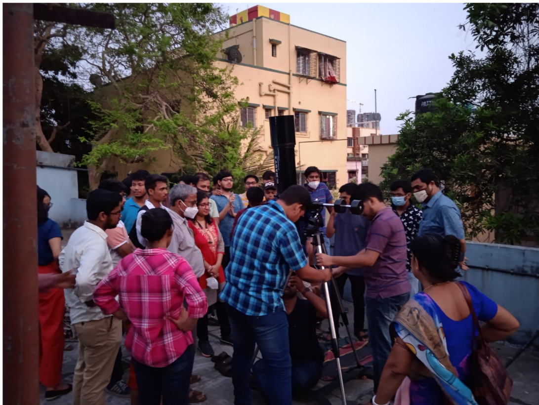
Fig. 5: Fixing the telescope

Even though it was the first sky watching camp and we faced many difficulties, still the whole experience was very much interesting. We hope to explore more things of the sky next time.