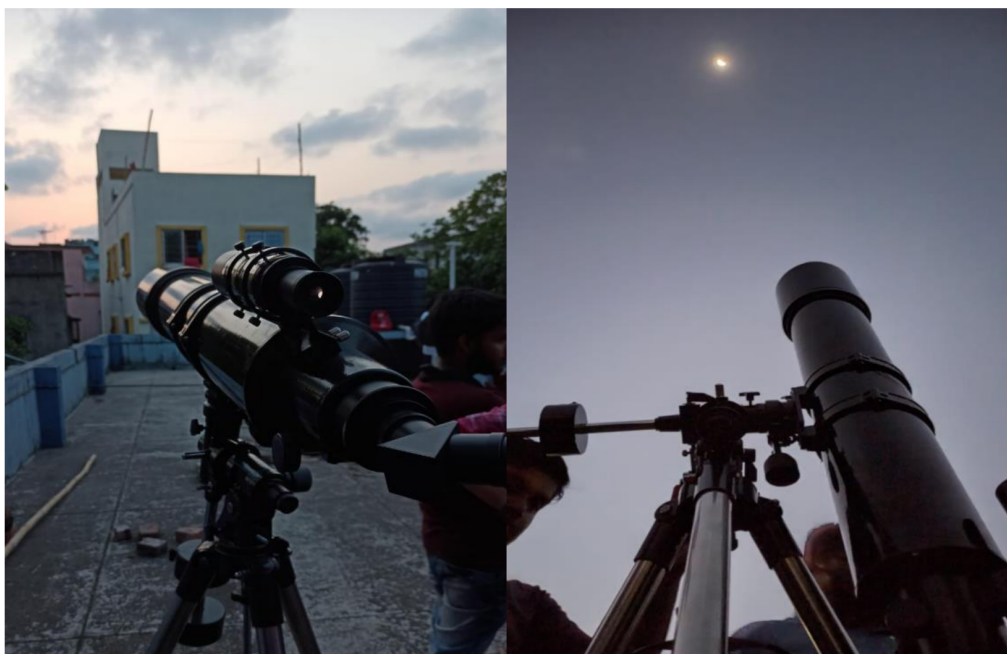
Figs. 1&2: Pictures of the telescope